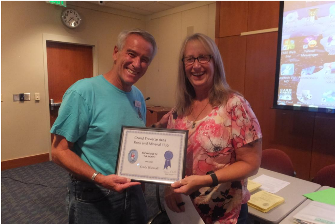
Rockhound of the Month